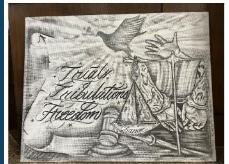
"Finding change making better choices from past experiences, learning, bettering oneself, and being free from substance, mental health issues, and just being happy."