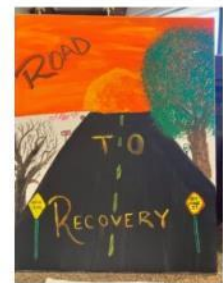
"This art reminds me of being in a scary dark road with everything being dead. Until I found the road with life, light, and meaning."