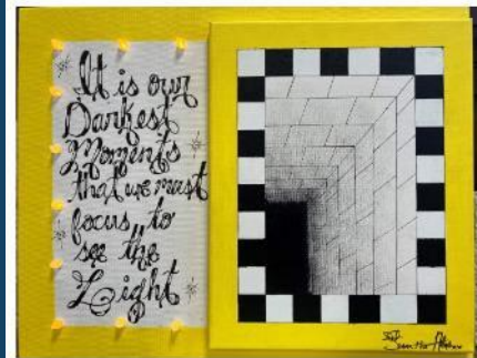
"Because its saying thru the darkest moments as in people going through addiction go through a dark phase and if they stay strong enough with the help of support, they will eventually see the light into a better life. The lights on the edge help display that."