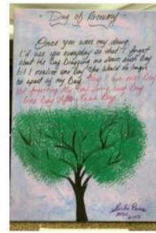
"This is how my days were and changing my days one day at a time."